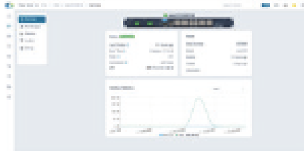
Entra vPON Manager