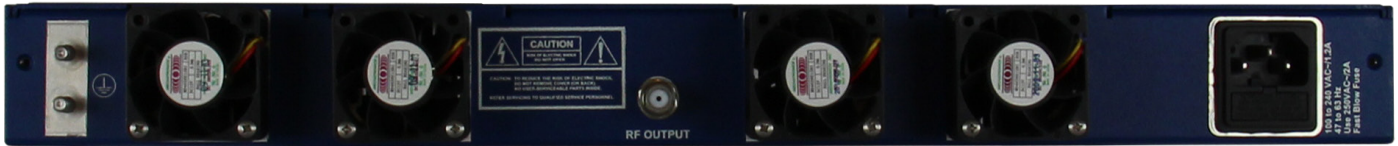
Concierge Rear View